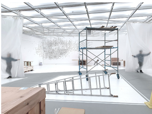
Obviously, no one can make heads nor tails. (Solo exhibition, Chiba City Museum of Art, Chiba), 2019