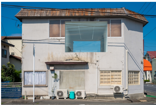
space (Arts Towada 10th Anniversary Exhibition:Inter+Play, Towada Art Center, Aomori), 2020-

目 [mé] Official WEBSITE http://mouthplustwo.me