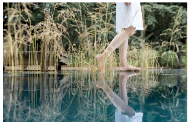
Elemental Detection (Saitama Triennale 2016, Saitama), 2016