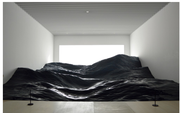
Contact (Roppongi Crossing 2019: Connexions, Mori Art Museum, Tokyo), 2019